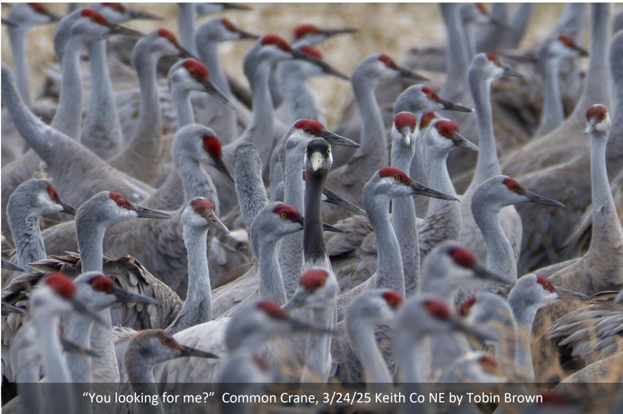
"You looking for me?" Common Crane, 3/24/25 Keith Co NE